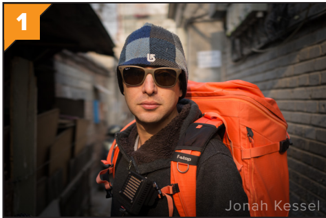
Image and text requirements for gear compositions