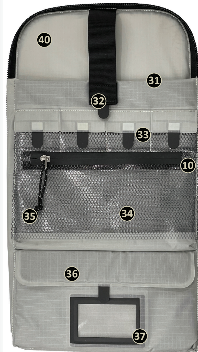
BACK PANEL INTERIOR VIEW