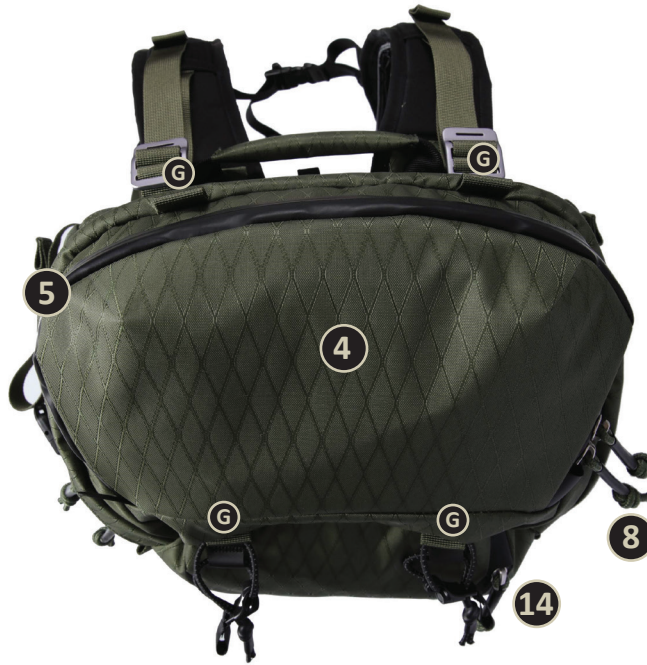
T O P