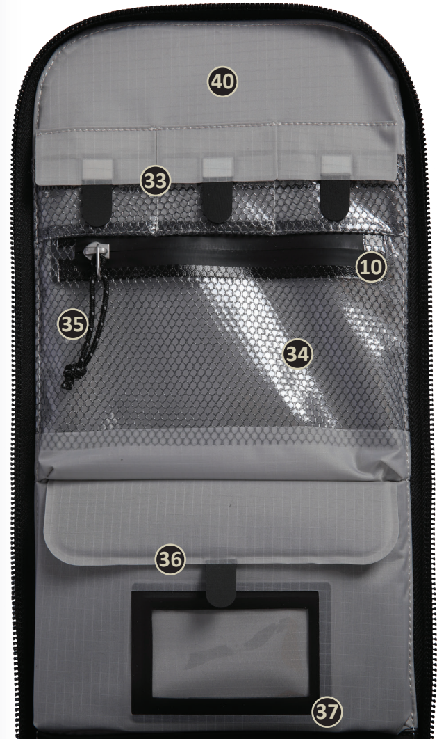
B A C K P A N E L I N T E R I O R V I E W