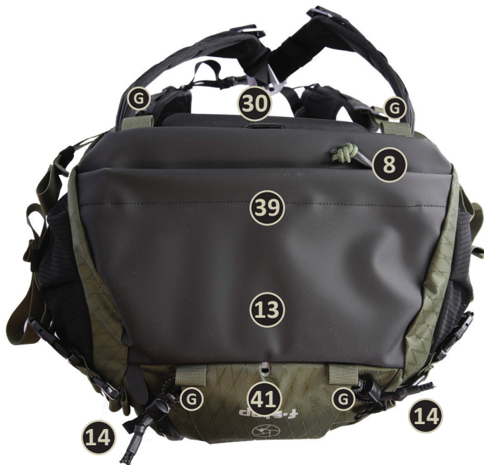
B O T T O M