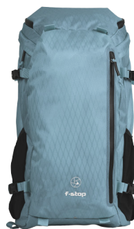
● Spring Lake