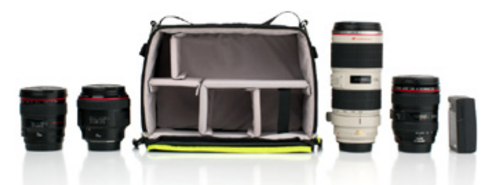
Canon 5DIII 24-70 f/2.8L II LC-E6 Charger 85mm f/1.2L 24mm f/1.4L